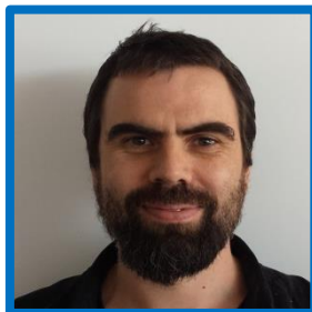
Ryan Information Technologies